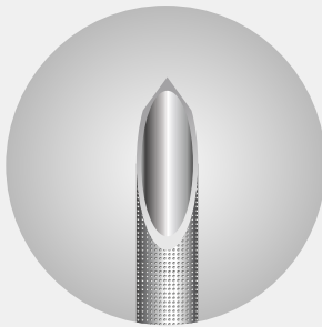
Tri-facet geometry with highly echogenic tip