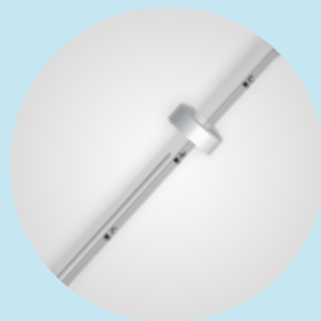
Silicone depth positioner