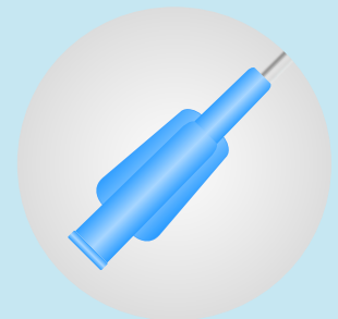
Integrally molded hub