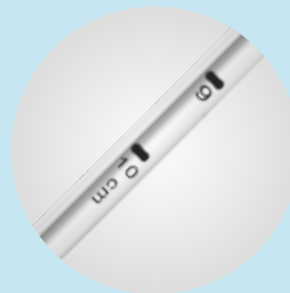
Centimetre marking provided