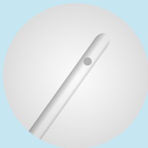
Smooth rounded tip