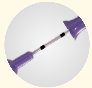
Centimetre marking on inner steel pipe