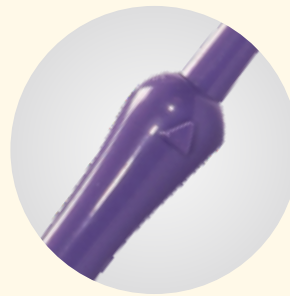
Orientation arrow on hub