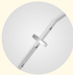
Silicone depth positioner